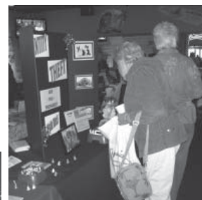
Pictured at left: SLCU's booth at the Glenwood Senior Citizen's TRIAD at the Minnewaska House. Over 200 Glenwood area senior citizens attended this event.