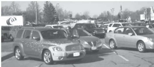
SLCU's Annual Spring Car Sale 05/02/09