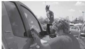
Pictured clockwise from the left: vehicles at the Spring Car Sale; Crystal-Pierz "marine guy" balloon; members taking advantage of the FREE Shred Truck; and a AAA representative applying the VIN etching to a member's vehicle.