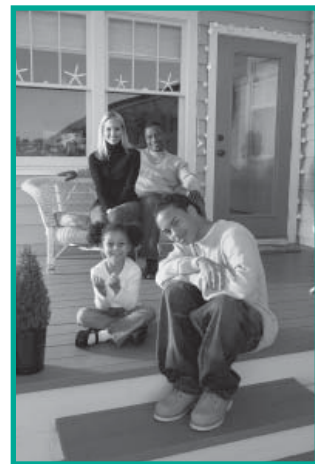
*Closing costs waived up to $250.00

Contact your SLCU Loan Officer today for help with your Home Equity Loan.